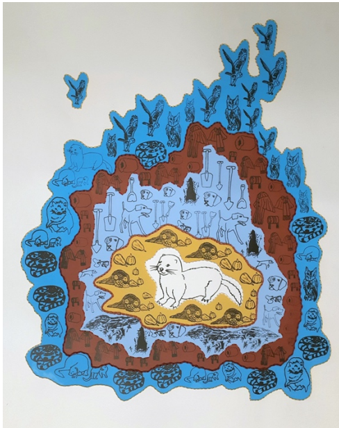
Lisa Bigalke , Exploitation of the Neogale Macrodon AKA the Sea Mink , 2020, Embroidery floss on serigraph, 30 x 22 inches