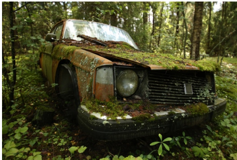
Jojin Van Winkle , The Destruction Project—Car Graveyard—Summer/near Haukijärvi, Finland , 2019, Archival digital inkjet print on acrylic plastic, 20 x 30 inches