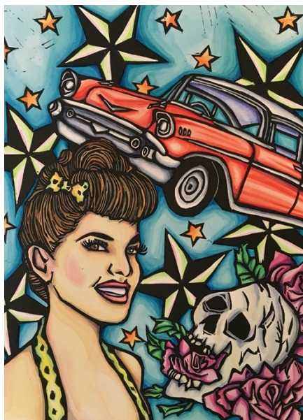
Kelly Witte , Rockabilly Rebel , 2017, Watercolor linocut, 12 x 9 inches

Each of these five recipients is presented a monetary award—$3,000 for the Artist Fellowship Recipients and $1,500 for the Emerging Artist—which may be used for any expenses that will assist in the development of new work and advance their artistic careers, such as equipment and supply purchases, studio rental, and travel.