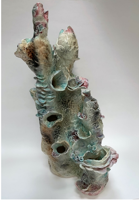
Peter Aymonin , Vessel 1 , 2020, Glazed ceramic, 17 x 8 x 10 inches